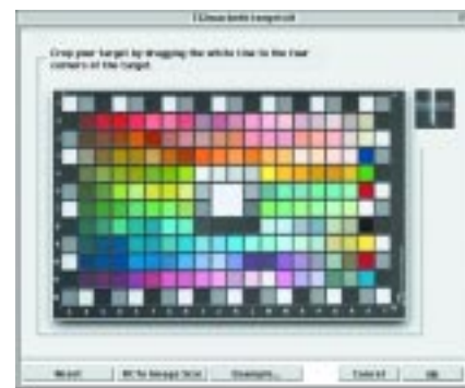
ProfileMaker Pro 3.1 can precisely crop a target, like the new DC Color Checker (above), and skew a selected target that has not been shot or scanned exactly square.

In the ProfileMaker module, a new area has been included to generate profiles for digital cameras. Naturally, it supports the new ColorChecker DC target created from the ground up by GretagMacbeth for profiling digital cameras. When bringing in either targets for digital cameras or scanners, ProfileMaker has one of the coolest and most useful features I've even seen in a such a product: The ability to actually skew a selection to account for a target that may not have been shot or scanned exactly square.