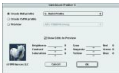
The sliders inside of Color Vision Profiler RGB can change saturation, brightness and color when creating a custom profile.

In addition to these, Color Vision sells two profile-editing plug-ins. Color Vision Doctor ($99) contains the same six sliders noted above in Profiler RGB as well as that very useful RGB soft proof tool. Color